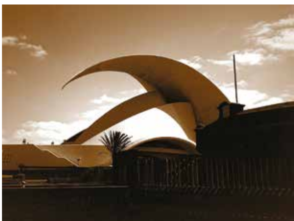
SANTIAGO CALATRAVA VALLS Benimámet, 28 July 1951

The Tenerife model seat , accommodates 2100 seats. Exclusive Calatrava design for this project. Formally organic, sinuous and elegant. Inspired by the design of the building.